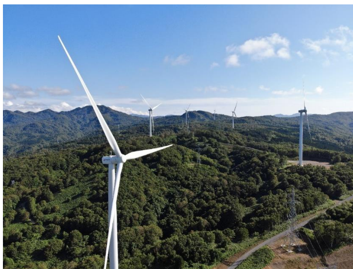
For reference: Adjacent Kaminokuni No. 2 Wind Farm (which began commercial operation on May 18, 2024)